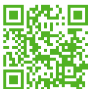
Sewing a Button