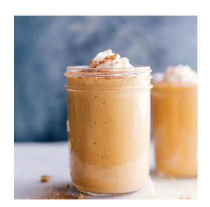
Butternut Squash Soup

Enjoy a variety of rich and energizing fall flavors – all in one bowl. This creamy soup is packed with robust dimensions of deliciousness.